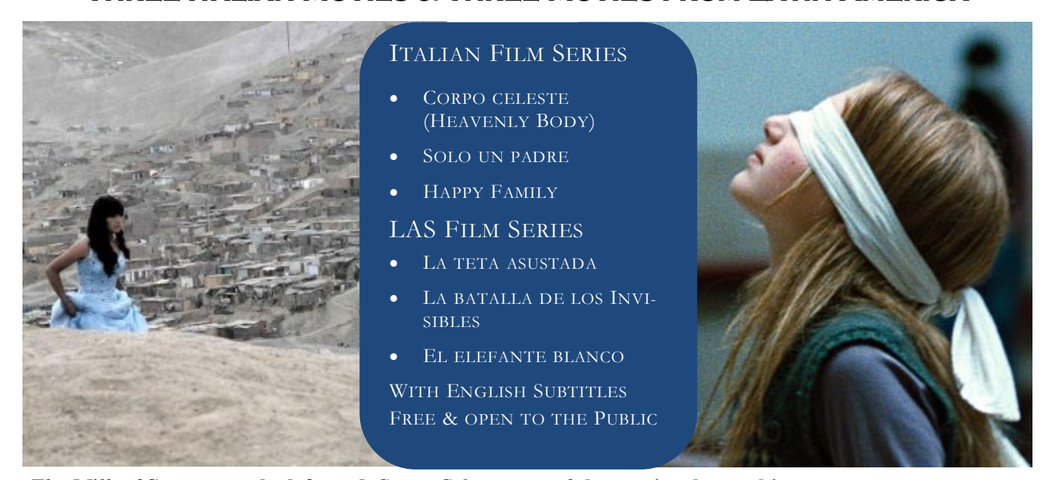
The Milk of Sorrow, on the left, and Corpo Celeste, two of the movies shown this semester.